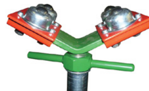
Ball Transfer Heads