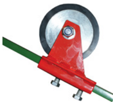
Rubber Wheel Heads