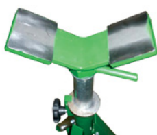
Stainless Steel Slipper

The Bull Roll Pipe Stand is the ultimate tool for fabricators who require a simple, safe, and affordable way to manoeuvre pipe. Optional modular heads create a versatile range of operations. All stands are supplied with a unique bearing system, which allows the stands to be raised or lowered even when the stands are fully loaded. Three fixed and two adjustable castors allow for the stands to be used on uneven surfaces.