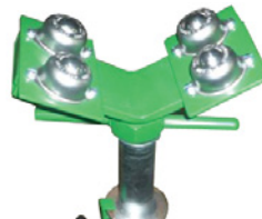
Stainless Ball Transfer Heads