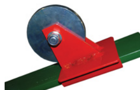
Steel Wheel Heads