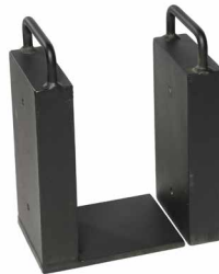
Fillet Insert Plates