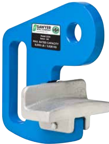
Pipe Hook (233) Wide Mouth Sizes 3"—42"