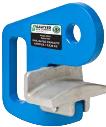
Pipe Hook (232) Sizes 3"—42"