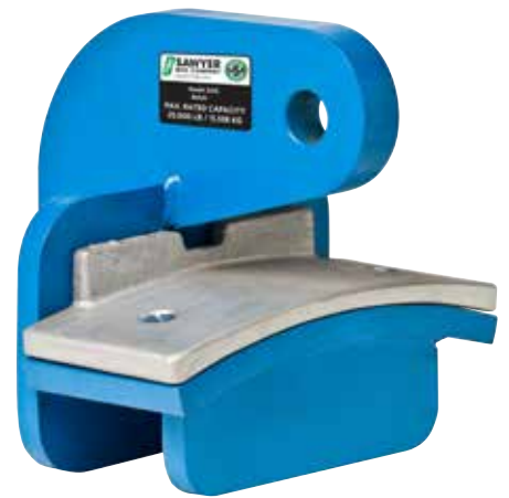
Pipe Hook (231C) High Capacity Sizes 44"—72"