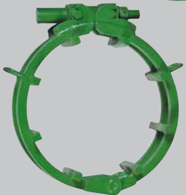
Ratchet 6" - 60" (125E)