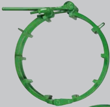
Hand Lever 2" - 60" (125A)