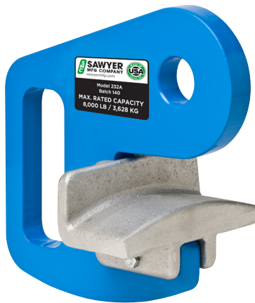
Pipe Hook (232) Sizes 3"—42"