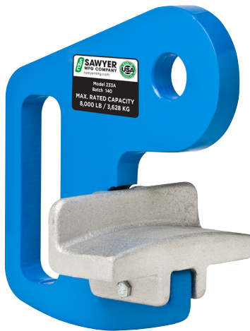
Pipe Hook (233) Wide Mouth Sizes 3"—42"