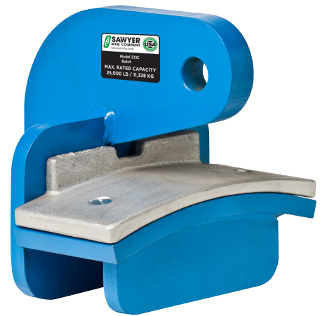
Pipe Hook (231C) High Capacity Sizes 44"—72"