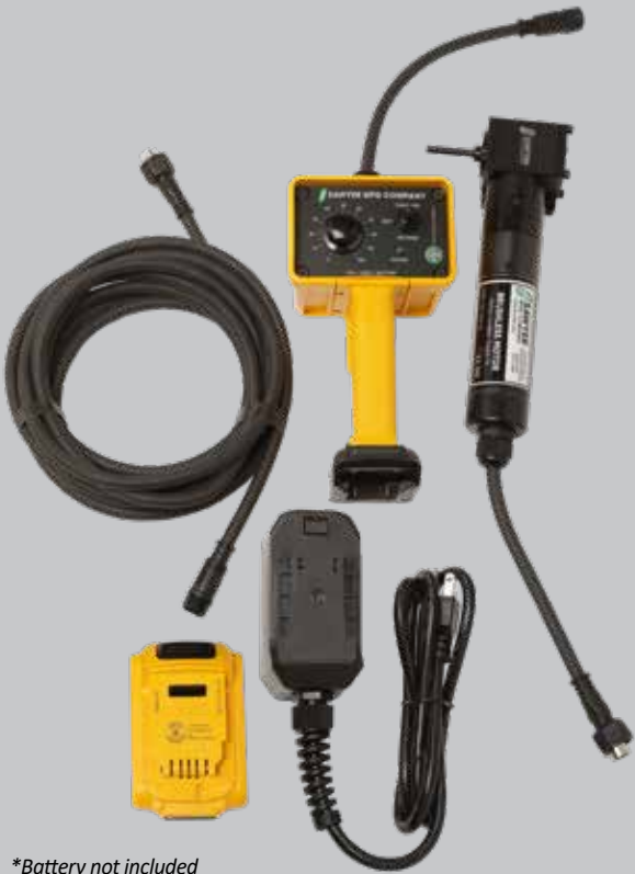
*Battery not included