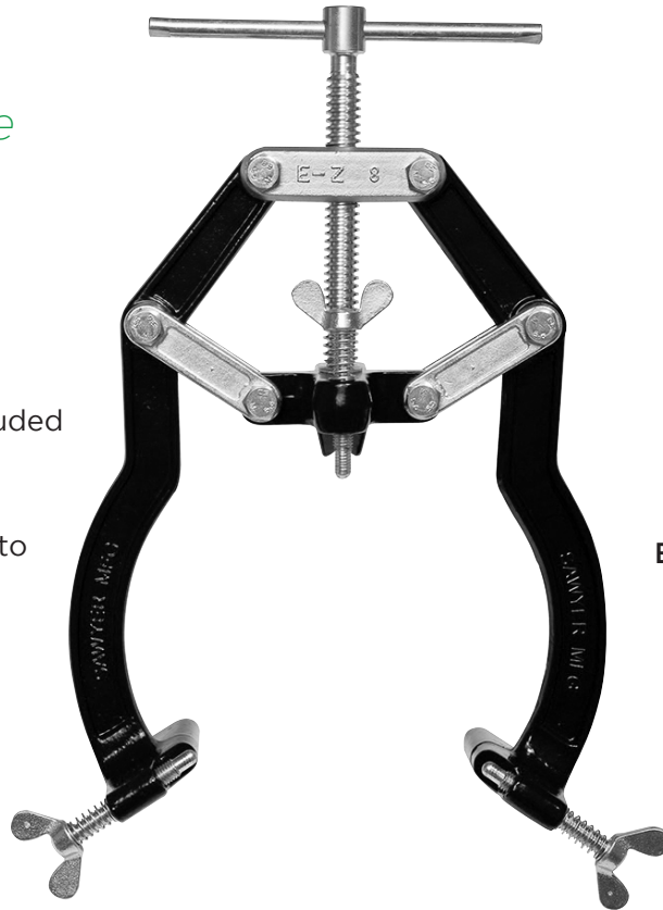
EZ Clamp (252)