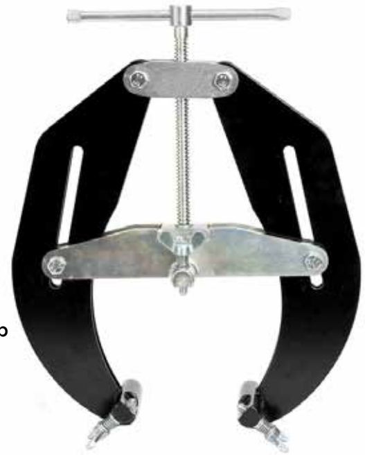
Qwik Clamp (251)