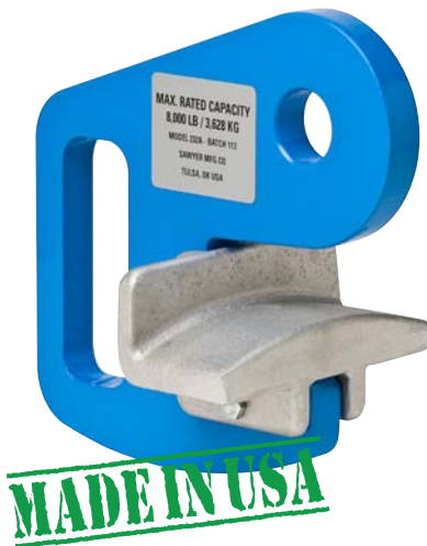
Pipe Hook (232) Sizes 3"—42"

Extra thick steel for longevity and greater safety