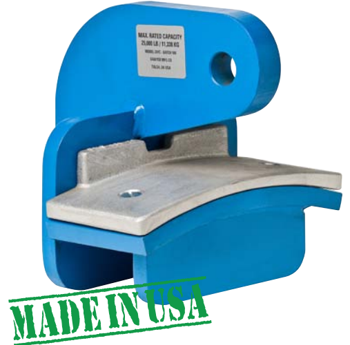
Pipe Hook (231C) High Capacity Sizes 44"—72"