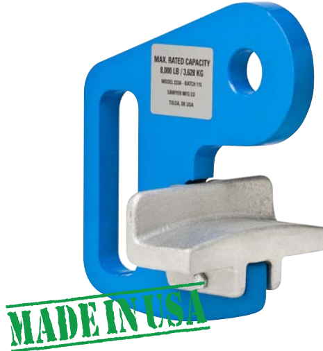
Pipe Hook (233) Wide Mouth Sizes 3"—42"