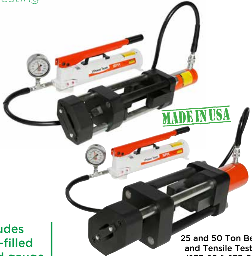
25 and 50 Ton Bend and Tensile Tester (273-25 & 273-50)