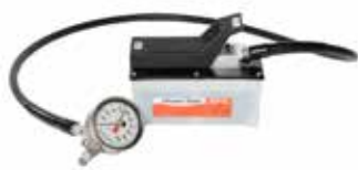
Foot Pump (273-25 & 273-50)