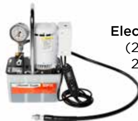
Electric Pump (273-25 & 273-50)