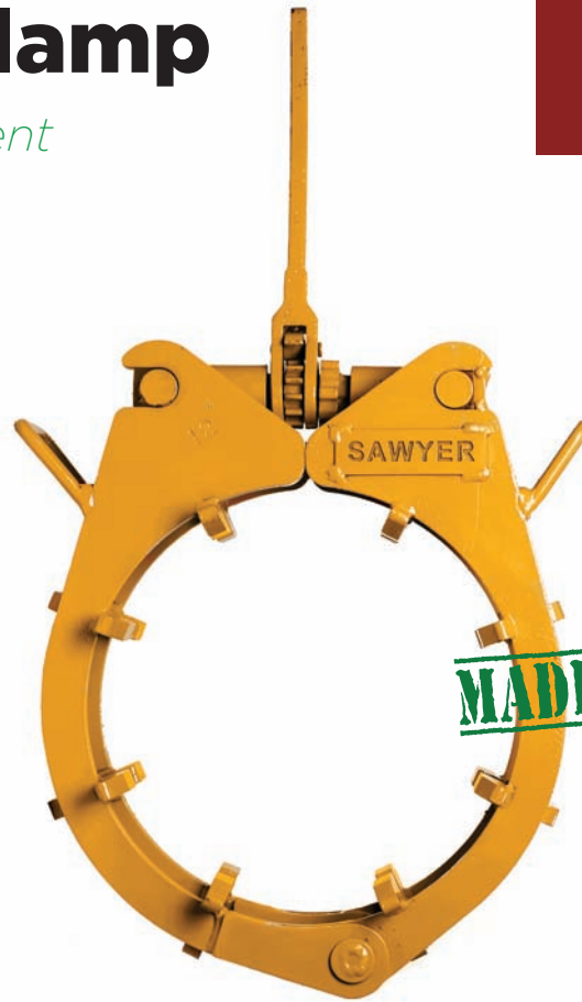
Ratchet Cage Clamp (255R)