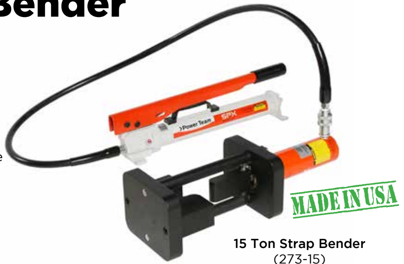
15 Ton Strap Bender (273-15)