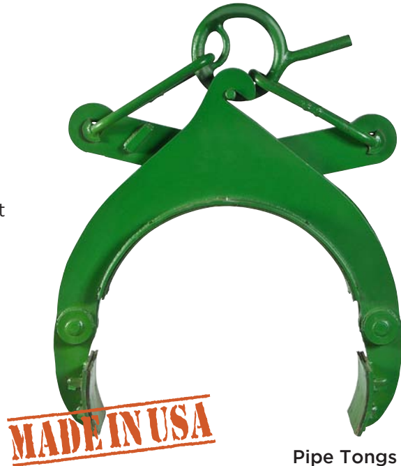
Pipe Tongs (125G)